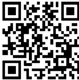
استماع 3 Super Goal