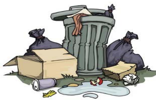
garbage / waste / landfill