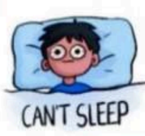
( tedious - restless )