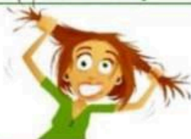
( anxiety - repetitive )