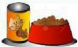
(corn flex - pet food)