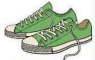
( sneakers - high heels )