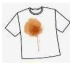
( ink - laundry stain )