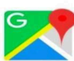
( drop rain - Google map )