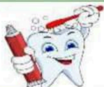
( toothpaste - cream )