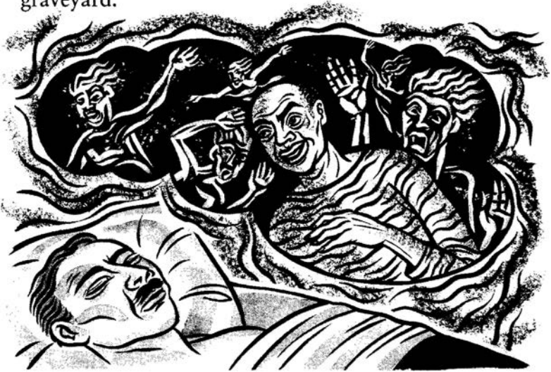
In his dream, Conway saw the spirits from the graveyard.

RRRRING! It was seven o'clock. Conway looked at his clock and got out of bed. He brushed his teeth. He was very tired after his bad night. But he washed his face with cold water, and he began to feel much better. He soon forgot about his dreams of Kee and the graveyard.