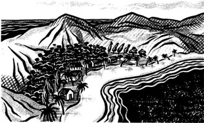
The coconut trees were moving slowly in the wind.

‘It looks beautiful, doesn’t it?’ Conway looked at the