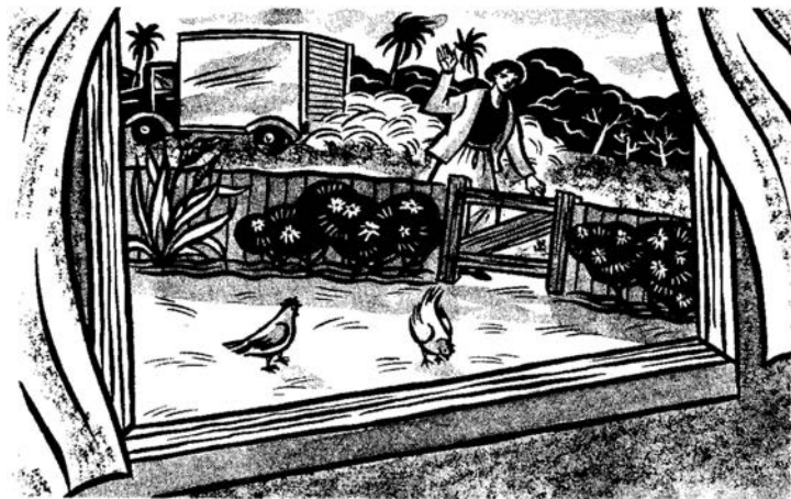
Karen Jackson walked up to the gate of Kee's garden.

'I see,' said Kee. 'But why do you want to talk to me?'