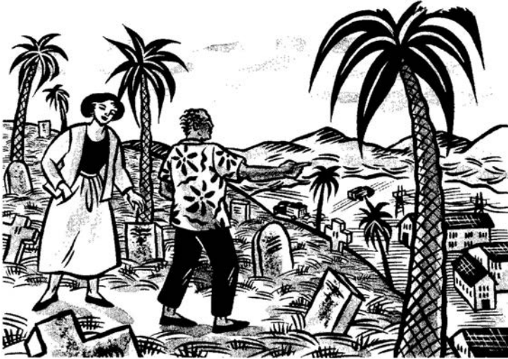
Karen and Kee walked through the graveyard.

They walked on through the graveyard, and Kee said, 'My grandfather is here in this graveyard. He was my mother's father. I remember the day when he died. I cried for a long time when I saw that big dark hole in the ground, and we put his body in the grave. It was raining. I was twelve years old. My mother and father were with me, and they were crying too.'