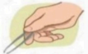
( trekking - tweezers )