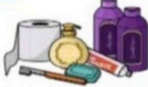
(surface - toiletries )