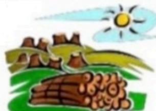
( cozy - deforestation )