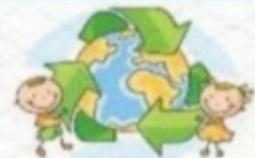
conservation - ranger)