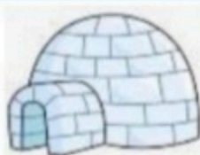
( igloo - cottage)