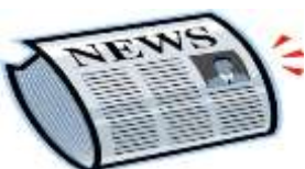
(script - newspaper )