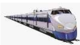
( train - spacecraft )