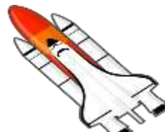
( rocket - satellite )