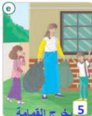
يخرج القمامة take out the trash