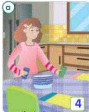
تعد المائدة set the table