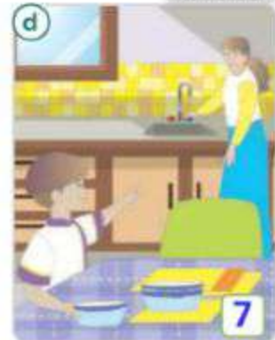
clear the table