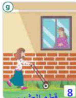
قطع العشب cut the grass