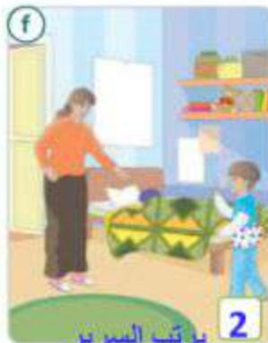
يرتب السرير make the bed