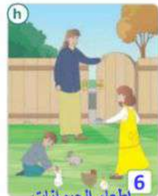
إطعام الحيوانات feed the animals