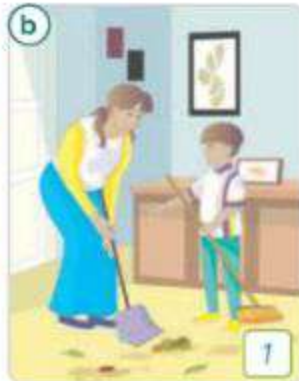
sweep the floor