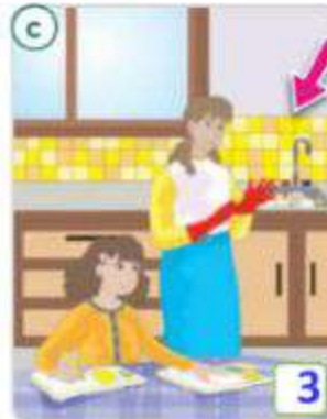
wash the dishes