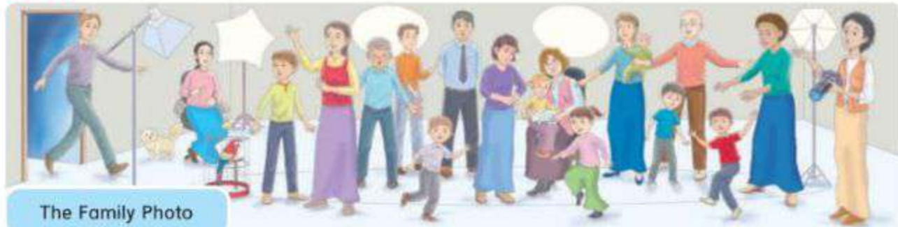
The Family Photo

Photographer: How often do you take family pictures?