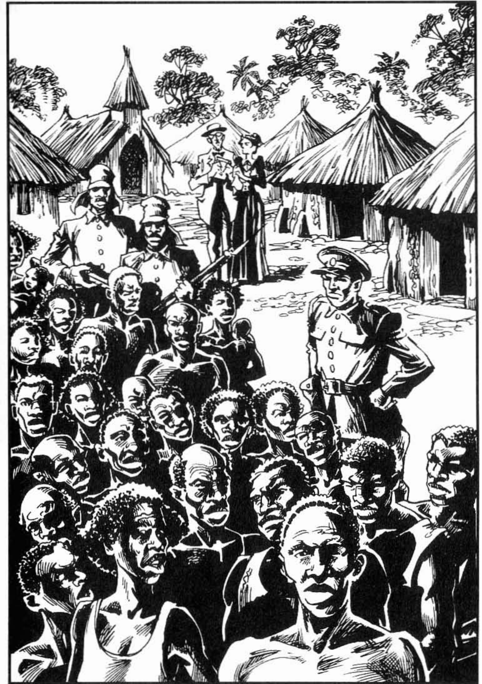
The German soldiers had taken all the villagers away.

'Oh God,' he prayed, 'help men to see that war is not the answer to their problems. Bring them, in the end, to a lasting peace. And God, look kindly on our brave country, England. Carry her safely through this most difficult time, and give her victory over the godless ones who are responsible for this disaster!' As he finished his prayer, Samuel sounded almost like a fighting man, and Rose had never admired her brother more. Tears fell through her fingers as she covered her face