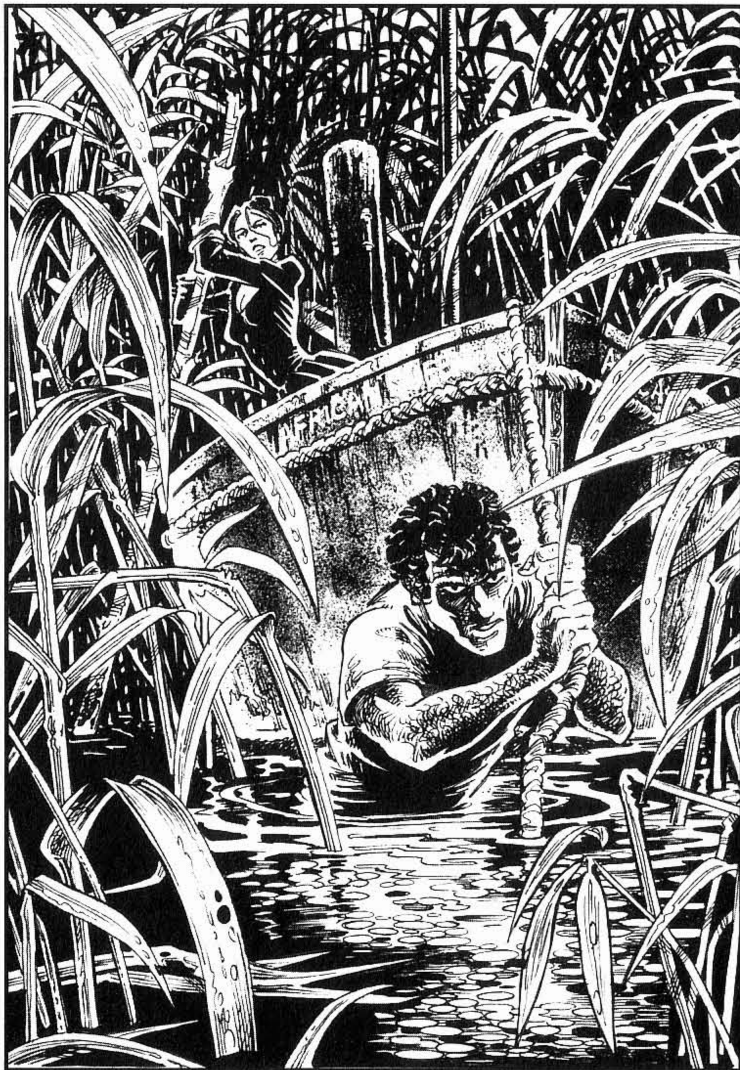
Allnutt tried to pull the boat along behind him.

‘All right,’ said Rose. ‘Give me the boat hook.’