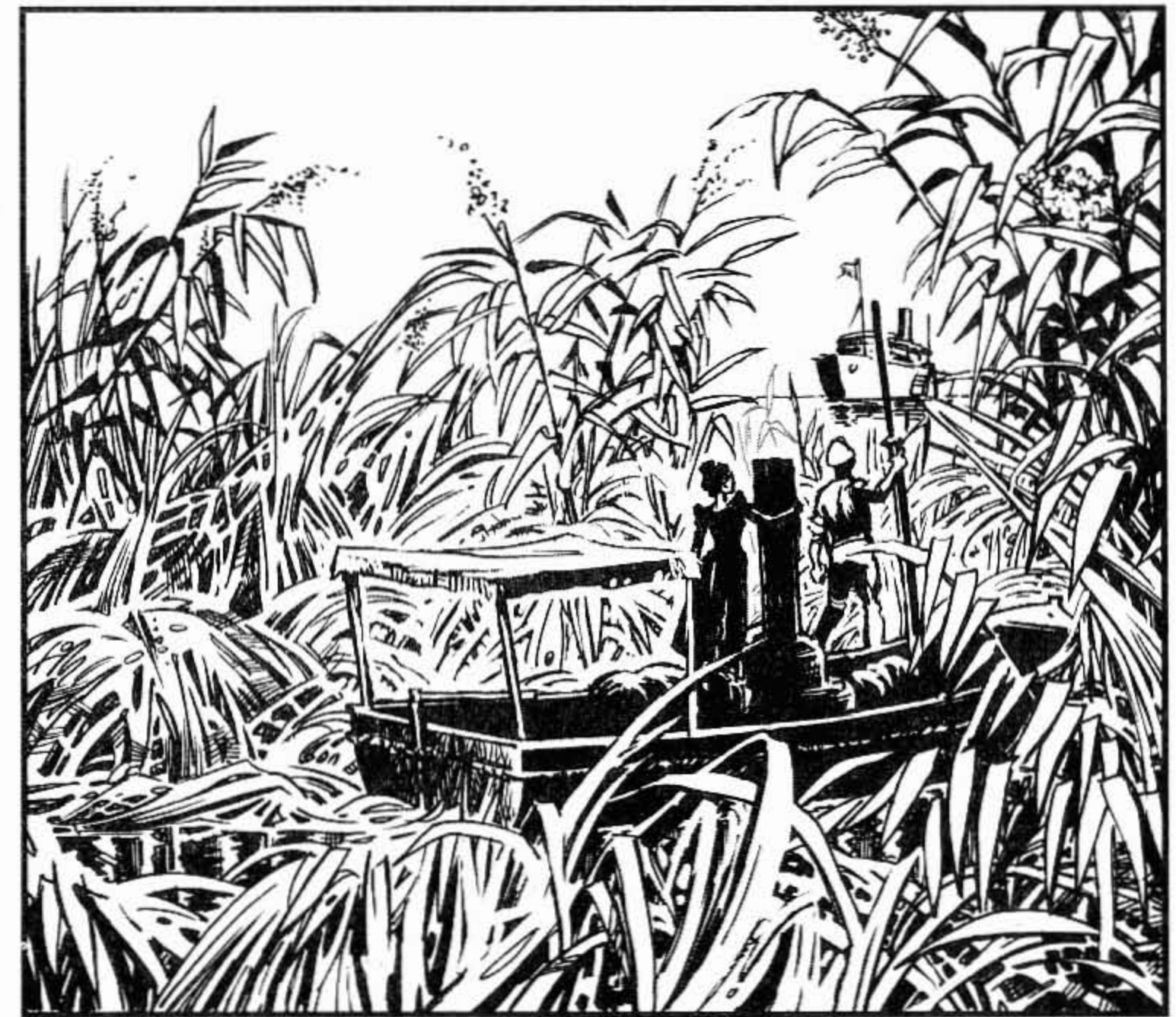
They watched the Königin Luise from their hiding-place.

'Look, they're going a different way now!' said Rose