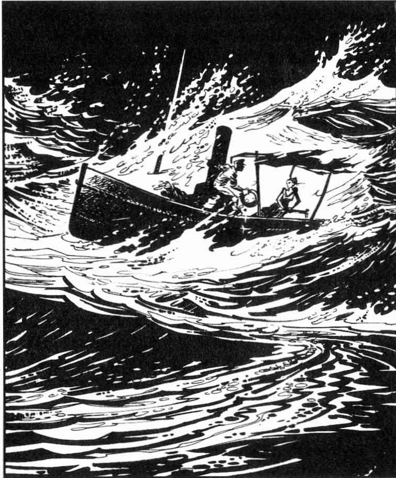
Rose fought with the tiller, and Allnutt rushed back to help her.

The African Queen went down, and the brave attempt to torpedo the Königin Luise for England failed. As the old boat disappeared under the waves, the storm died away and soon the waters of the lake were once more smooth and calm.