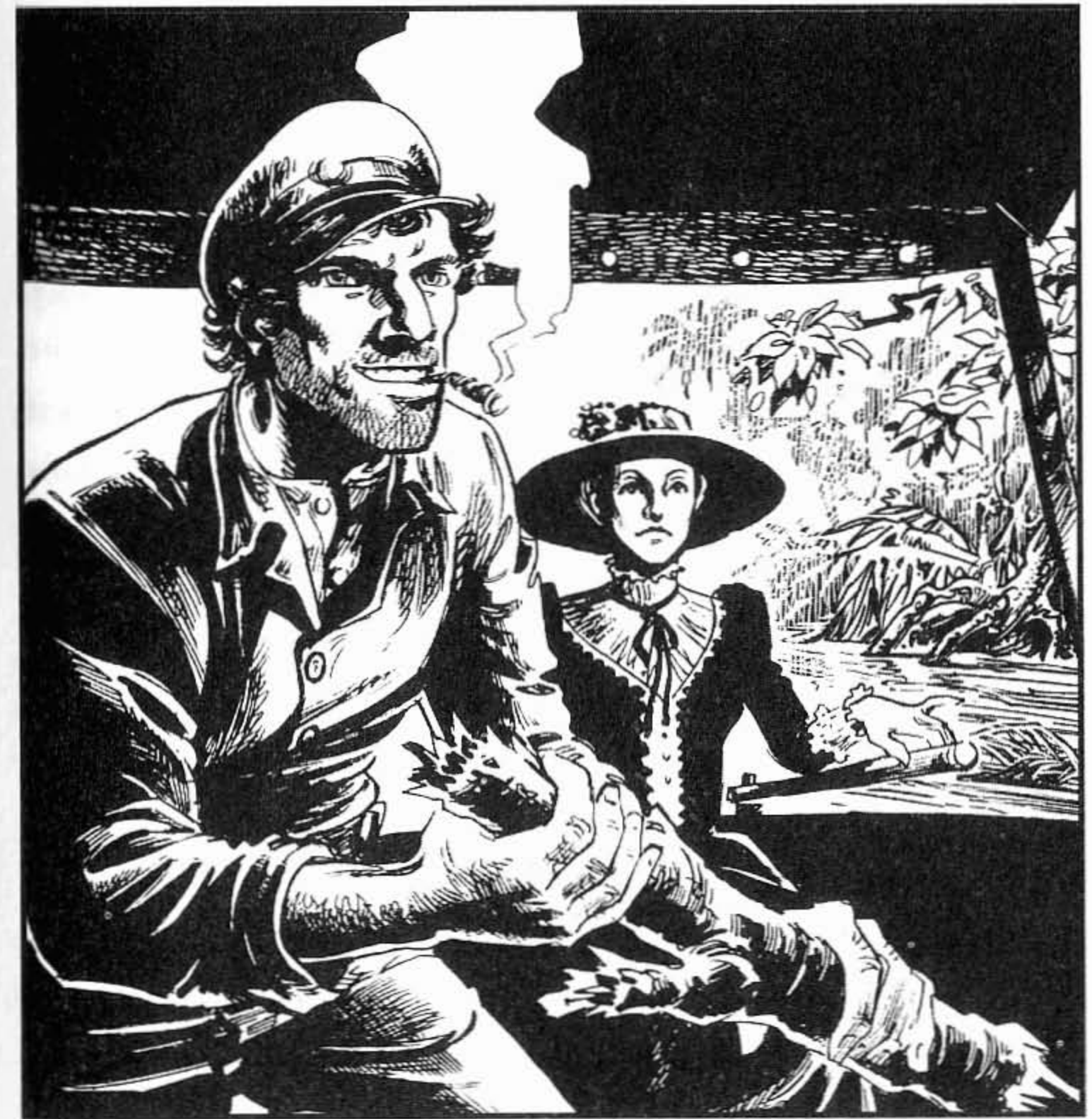
Allnutt kept a careful eye on the river ahead.

Rose silently took hold of the tiller; it was so hot that it seemed to burn her hand. She began to enjoy feeling the boat move obediently as she put the tiller to one side or another, while Allnutt put more wood on the fire, and kept a careful eye on the river ahead. Plants grew thickly on the muddy bed