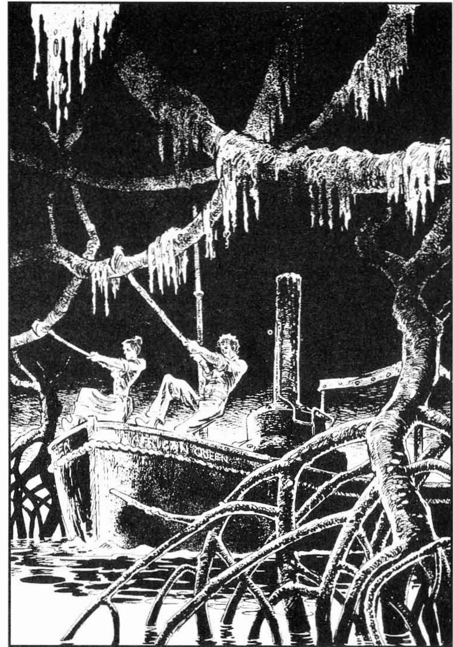
They lost all count of time in that dark mangrove swamp.

Then the channel took another turn, and in front of them was a view in which there were almost no mangroves.