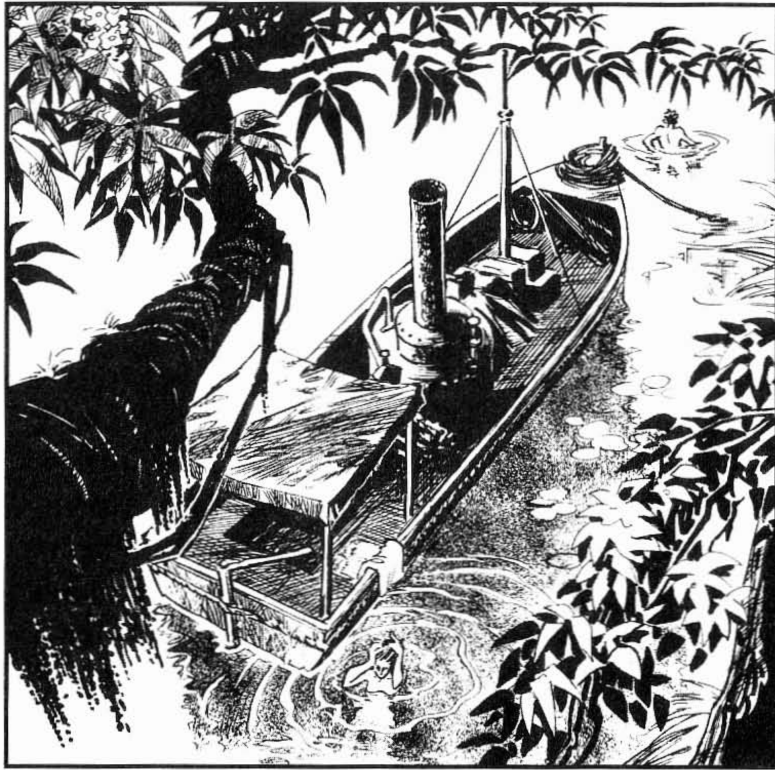
The water felt wonderfully cool on Rose's hot skin.

'No,' said Rose sharply. Her brother had spoken so often about the terrible effects of strong drink, but he had failed to