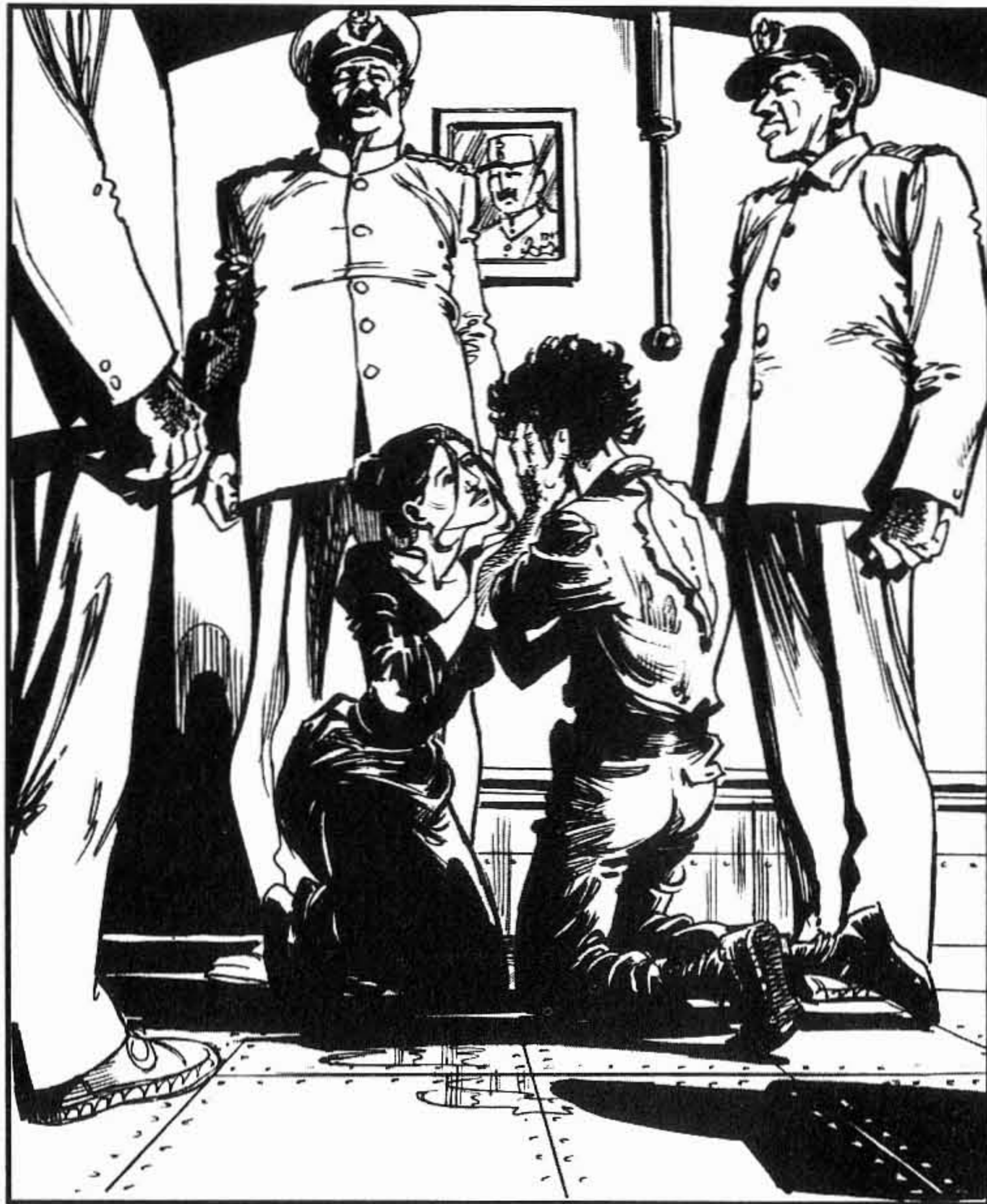
Rose went to Allnutt at once and knelt in front of him.