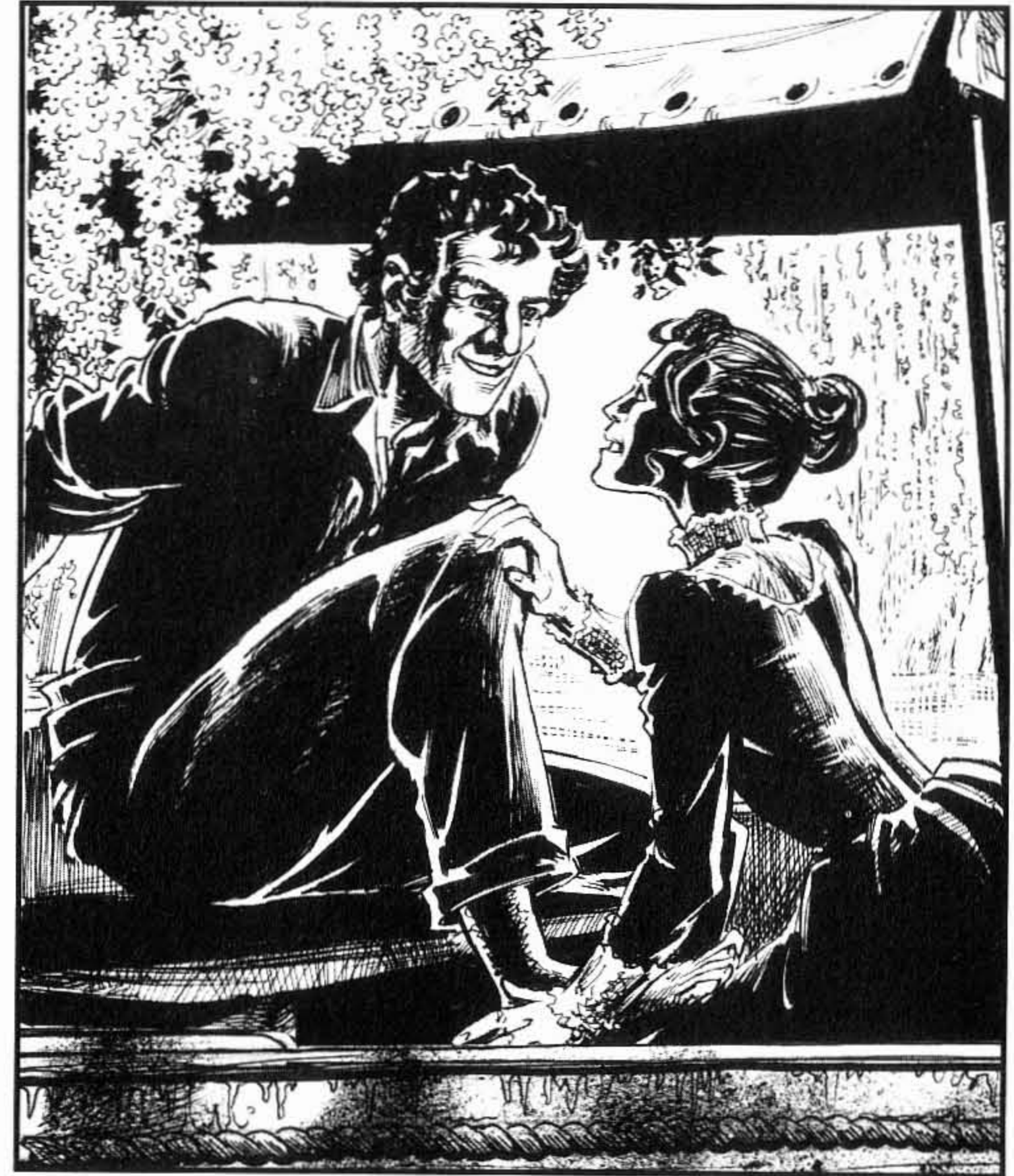
It was impossible not to think of love, surrounded by the wild beauty of the Ulanga.

careless and untidy, unable to cook a meal or clean a room. These ladies explained to Rose that women had to spend all their time clearing a path for men in life, but at the same time, men were like gods, and must be loved and obeyed.