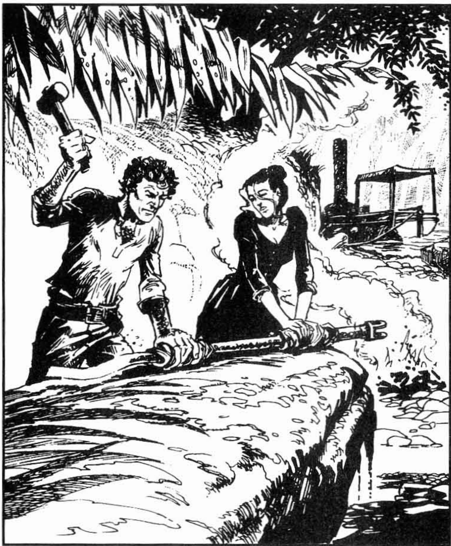
It was a week of back-breaking and dangerous work.

Rose was so full of hope, and so sure that Allnutt could do it that in the end he agreed to try. He put his doubts to one side, and they started almost a week of back-breaking, and