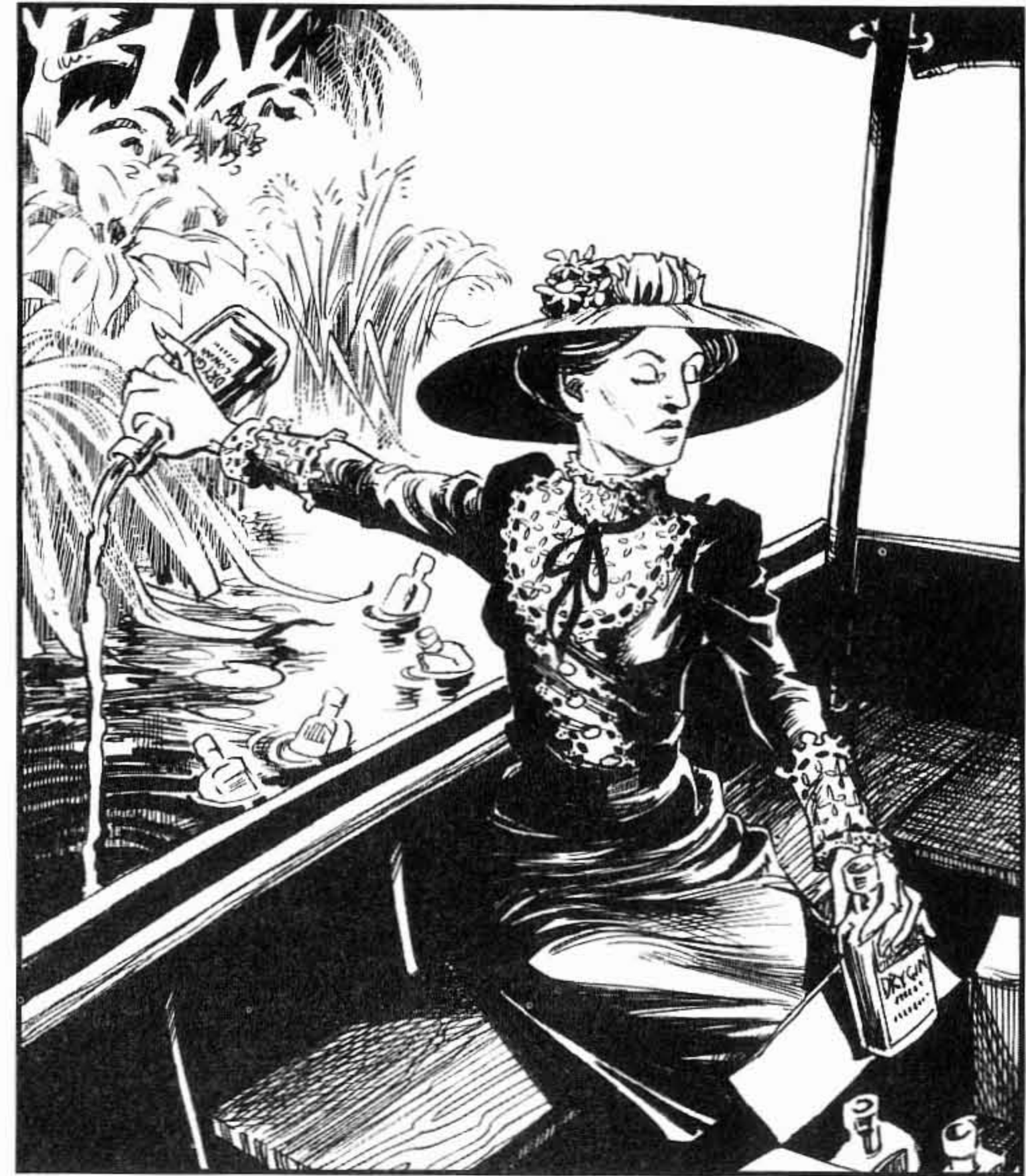
Rose was emptying all the gin bottles over the side of the boat.

Rose went on calmly with her sewing, while Allnutt spent some time repairing the boiler and the engine. But when he had washed all the oil off himself, there was nothing left to do. And all round him was the silence of the river, which in itself was enough to make him feel lonely and uncertain.