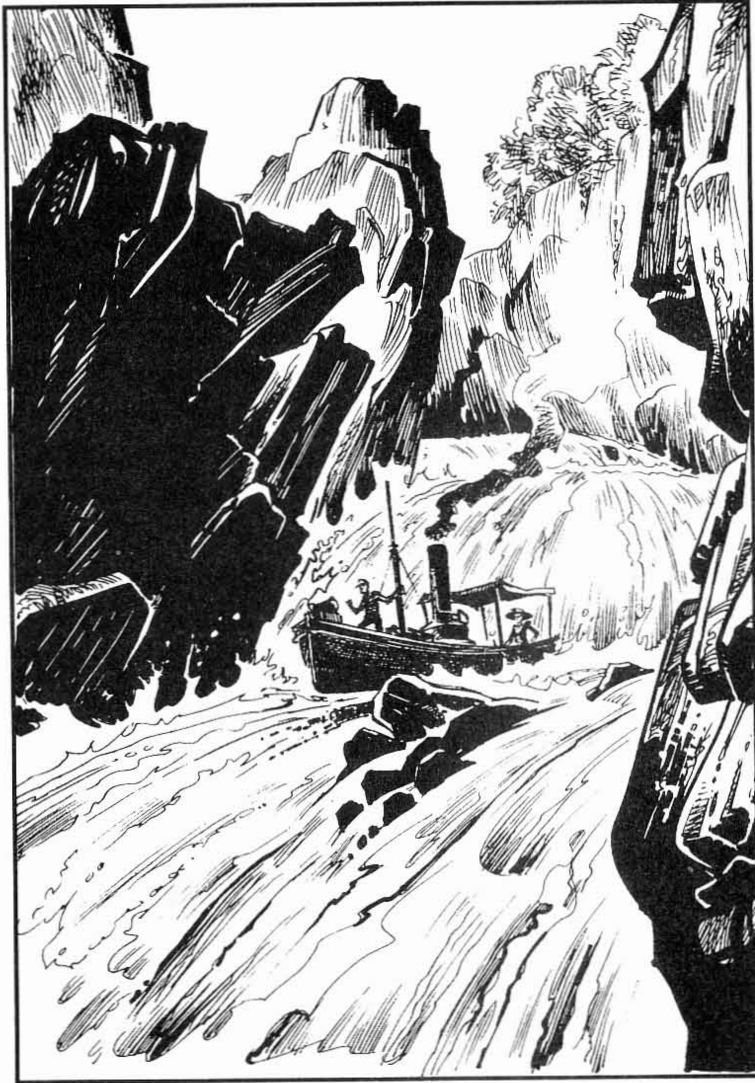
Rose rode the rapids like a queen of the sea.

work with fear in his heart. For the first time since he left school, he was saying his prayers.