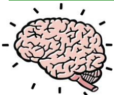
( colon - brain )