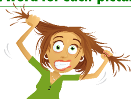
( anxiety - repetitive )