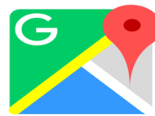
( drop rain - Google map )