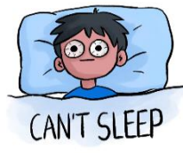
( tedious - restless )