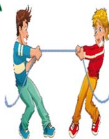
tug of war