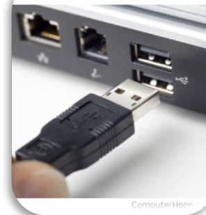
USB cable and port