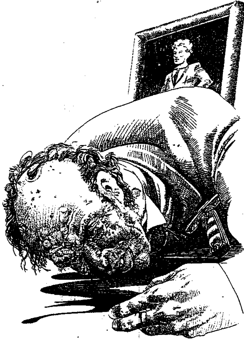
Lying on the floor was a dead man, with a knife in his heart.