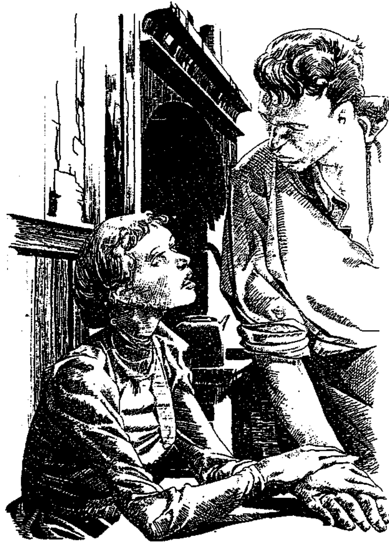
'Oh James, don't be angry with me today,' cried Sybil Vane.

'Then take care of her.' James Vane gave his mother a long, hard look. 'If that man hurts my sister, I'll find him, and kill him like a dog.'