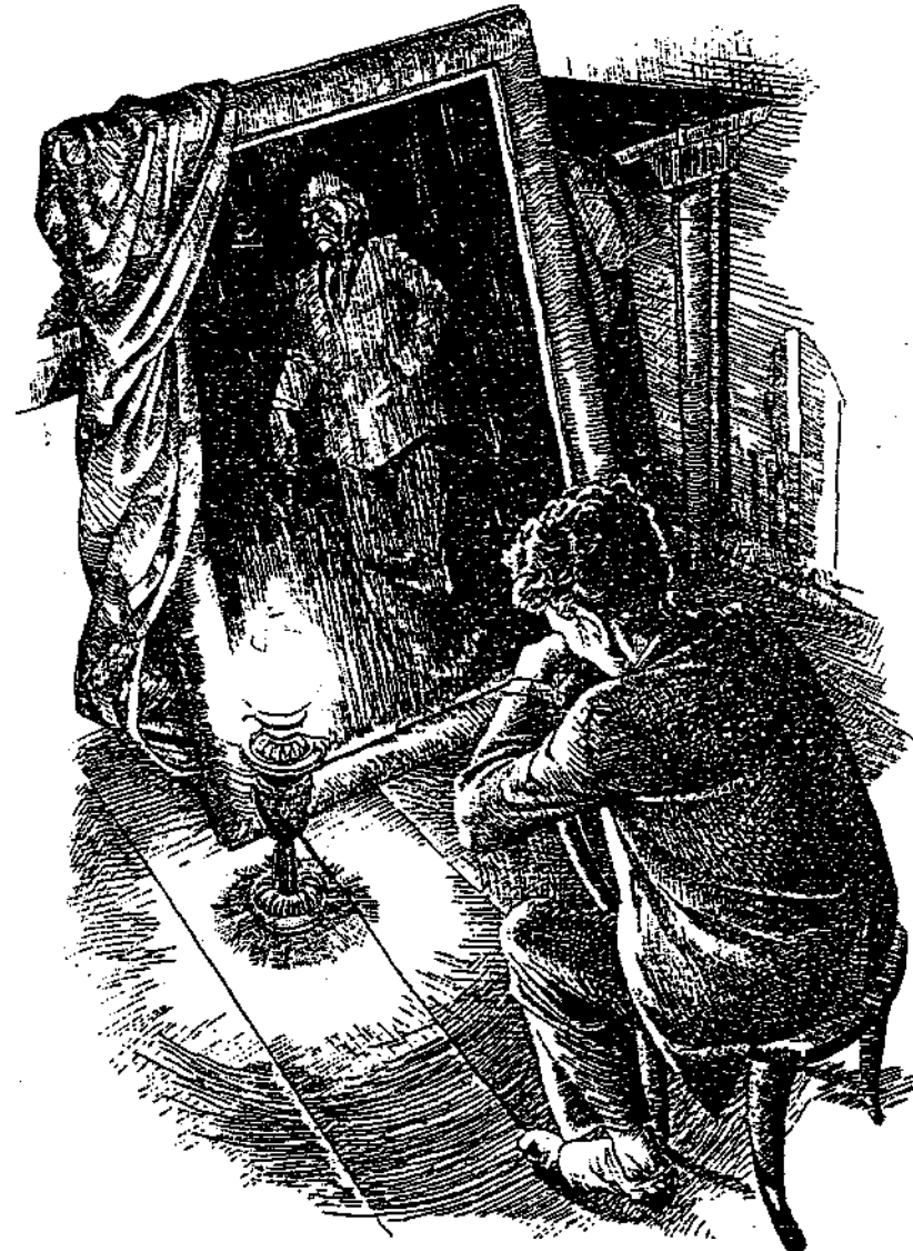
As time passed, the face in the picture grew slowly more terrible.

But behind the locked door at the top of the house, the picture of Dorian Gray grew older every year. The terrible face showed the dark secrets of his life. The heavy mouth, the yellow skin, the cruel eyes - these told the real story. Again and again, Dorian Gray went secretly to the room and looked first at the ugly and terrible face in the picture, then at the beautiful young face that laughed back at him from the mirror.