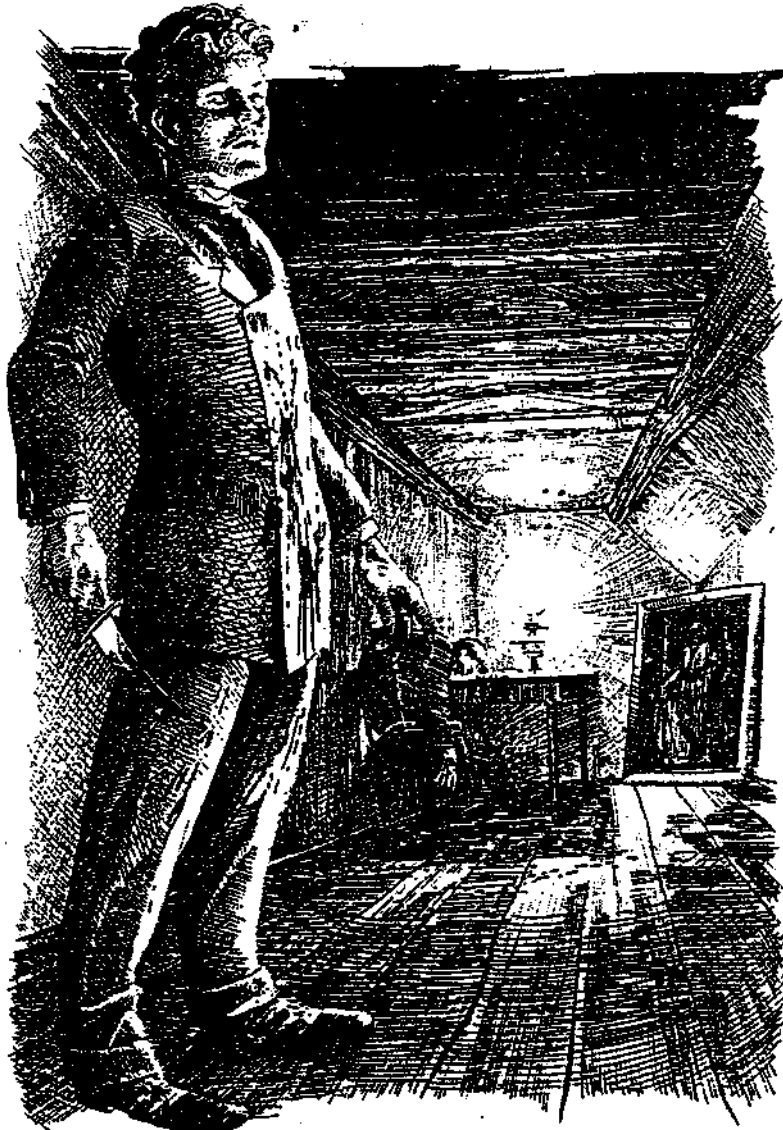
Dorian stood and listened. He could hear nothing — only the drip, drip of blood onto the floor.

again. The murdered man's head fell forwards, and the blood ran slowly across the table, and down onto the floor.