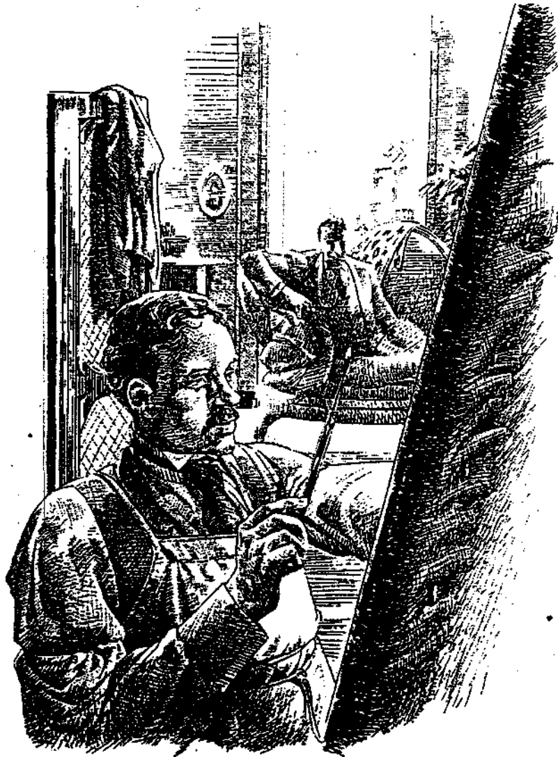
'It's the best portrait that you've ever painted, said Lord Henry.'

your strong face and black hair, you are not beautiful.'