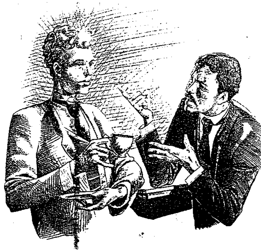
'You went out to dinner when Sybil Vane was lying dead in some dirty theatre?' asked Basil.

'Stop, Basil! I won't listen to you!' Dorian jumped to his feet. 'Sybil Vane is in the past . . . finished . . . forgotten.'