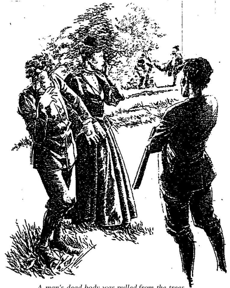
A man's dead body was pulled from the trees.

There were shouts and calls from the men, and then a man's body was pulled from the trees. Dorian turned away in horror. Bad luck seemed to follow him everywhere.