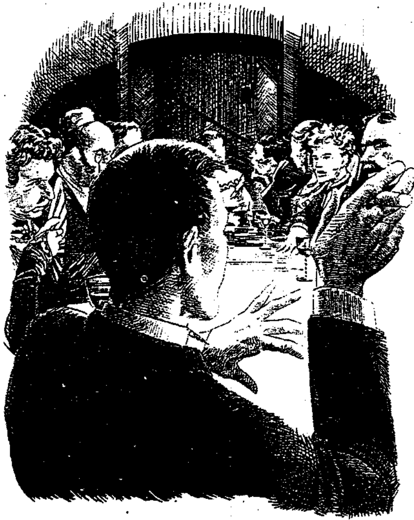
Dorian Gray never took his eyes away from Lord Henry.