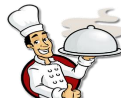
( reporter - chief)