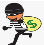
( Policeman - robber )