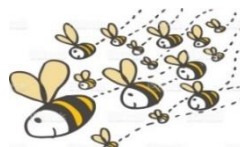
( fraud - swarm )