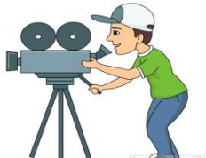
( cameraman - driver )