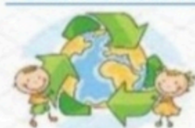
conservation - ranger)