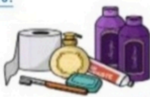
( surface - toiletries )