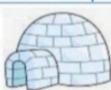
( igloo - cottage)