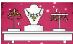
( display - blunder )