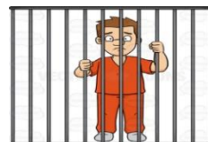
( inmate - pavement )