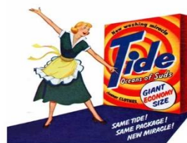
( plot - advertisement)