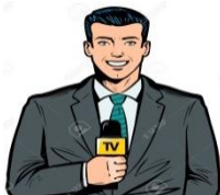
( presenter - episode)