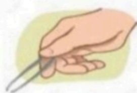
( trekking - tweezers )