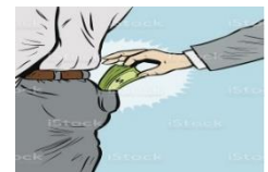
( pickpocket - prisoner )