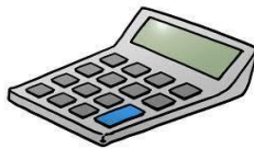
16 – calculator