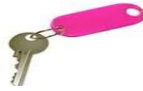
12- Key chain