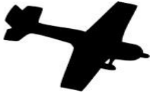
10 – airplane