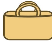
15- tote bag