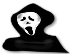
(comedy - horror)