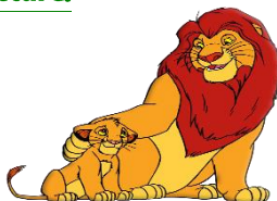
(epics - animation)