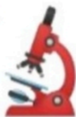
( microscope - robot )