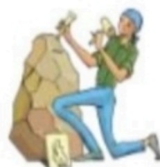
( sculptor - reporter )