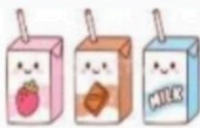
( trends - flavor )