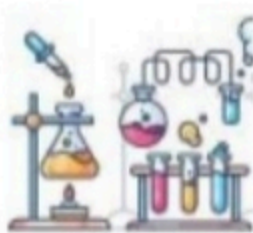
( staff - test tube )