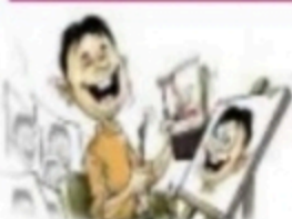
( animator - designer )