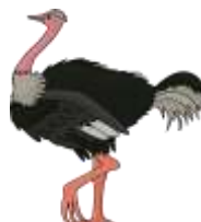
(giraffe - ostrich )