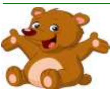
(turtle - bear )