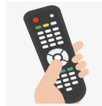
(remote control - calculator)