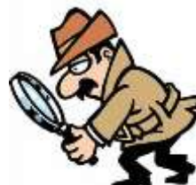
( cop - detective )