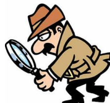
(cop - detective)