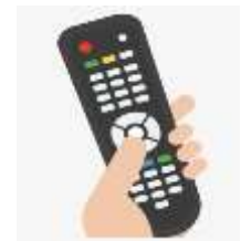
( remote control - calculator)