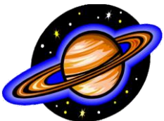
(planet - meteorite)