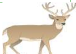
( deer - spacecraft )